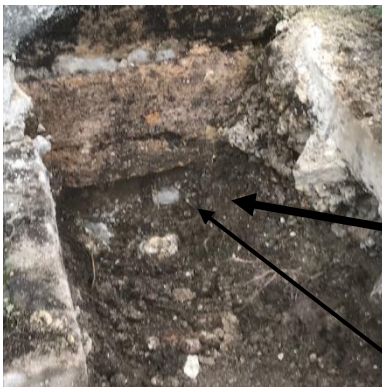
Base of Foundations

You may have read in the February Edition of the Parish Magazine that the North Aisle of our Church is being investigated for the stability of the North West Corner. Inside cracks have opened up which have recently enlarged, perhaps due to the last summers hot weather. On Wednesday 22 nd February some test pits were dug to investigate further. The path is now closed on the North Side of the Church for safely reasons. The general findings are that when some drainage pipes were installed parallel to the North Wall, probably in the 1950's or earlier. At this time the 16 th century lime concrete foundations that are at least 50cm under the stone work, where broken up to enable the pipe run to be installed. Hence the instability of the North West Corner. There are plans to install steel rods through the building to stop the roofs from spreading, repair two windows, an arch and a monument. At the same time the walls, as far as possible at the lower level, will be made good by local labour.